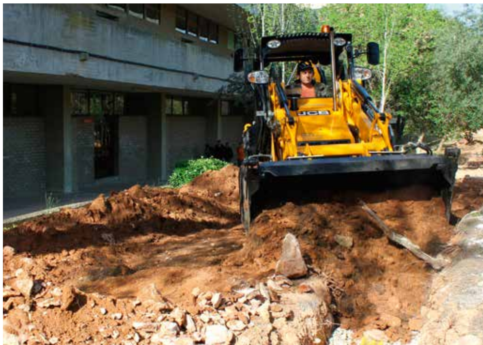
As the ultimate 2-in-1 machine, the ICX can save you time and money.

This backhoe is smoother, more powerful and more productive than an ordinary skid steer with attachment.