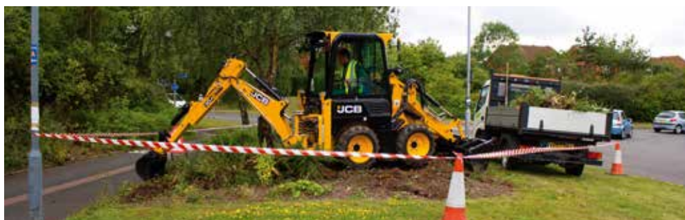
The ICX uses less fuel than alternative machines, further reducing running costs.