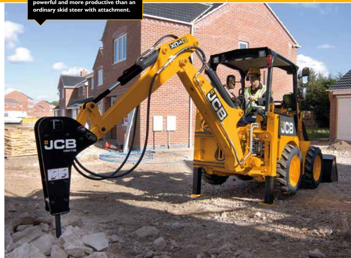
A versatile machine, made even more so by a vast range of attachments.