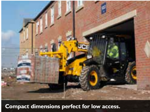
Compact dimensions perfect for low access.