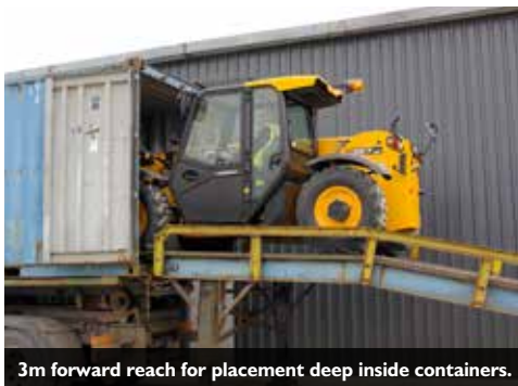
3m forward reach for placement deep inside containers.