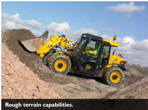
Rough terrain capabilities.