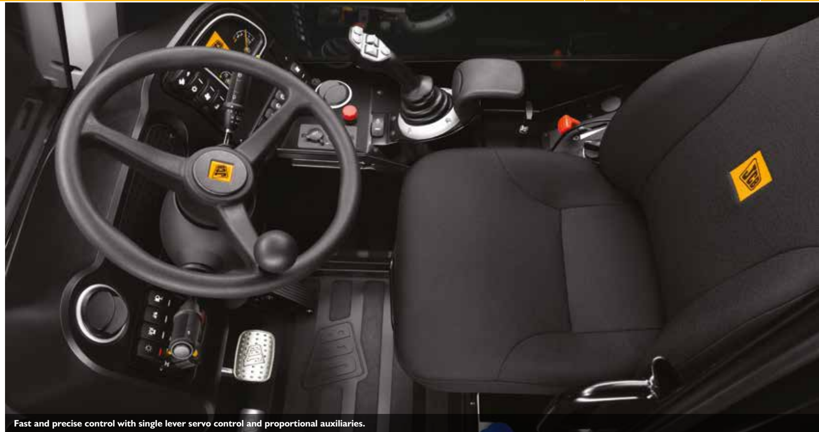
Fast and precise control with single lever servo control and proportional auxiliaries.