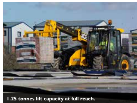
1.25 tonnes lift capacity at full reach.