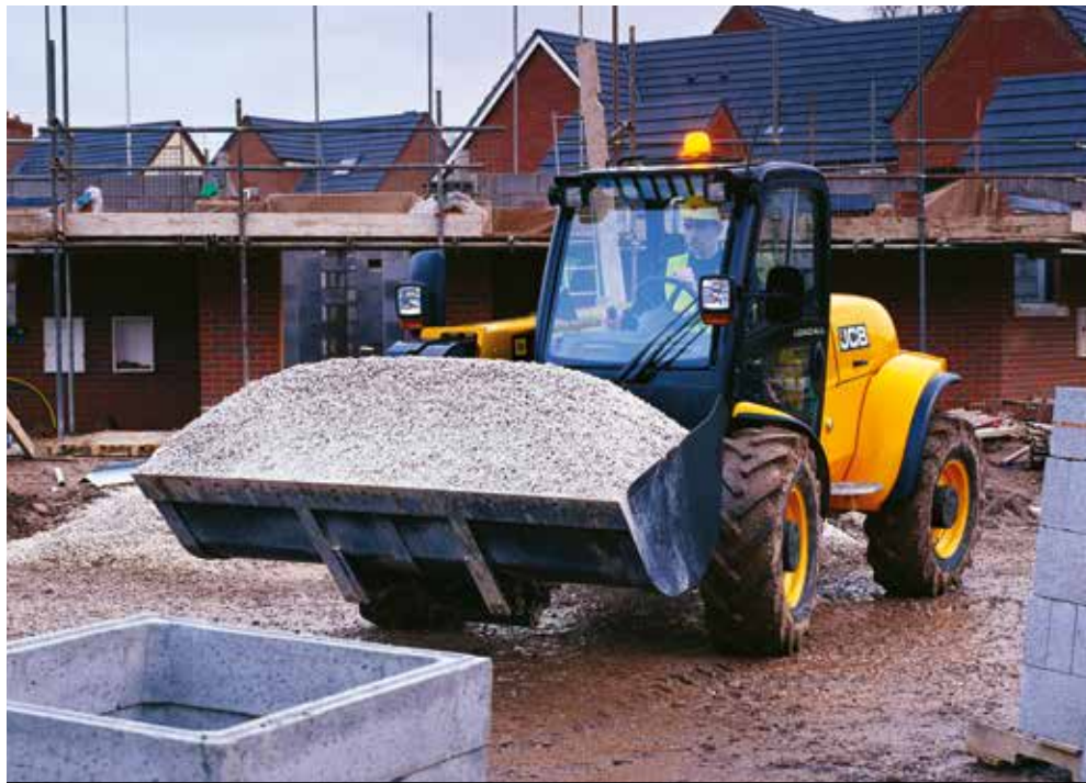
Excellent manoeuvrability in tight spaces.