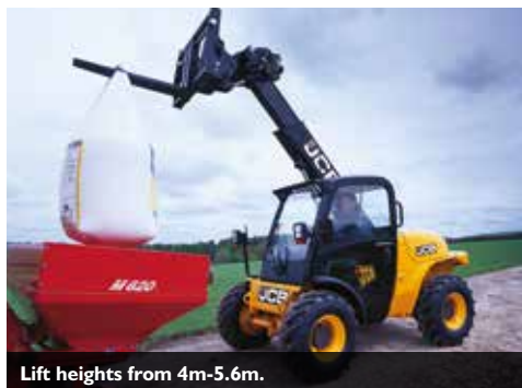
Lift heights from 4m-5.6m.