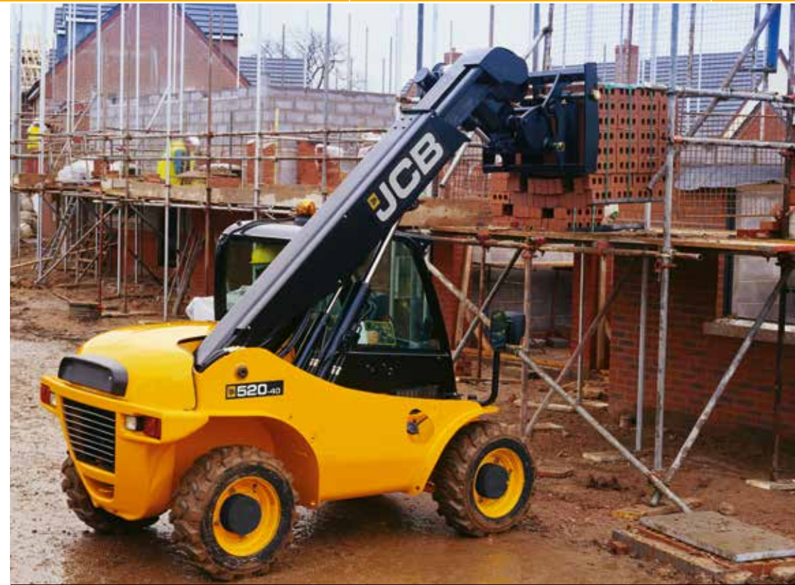
Lift capacity is impressive for such a small machine.